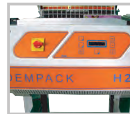
User friendly set up